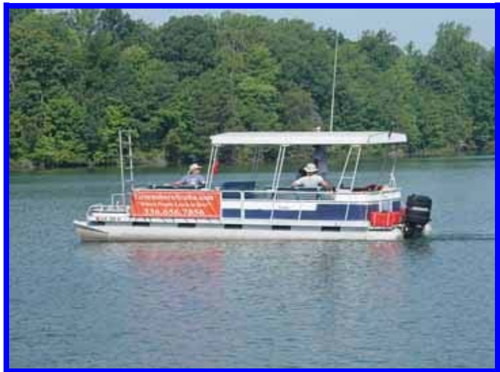
Kid-less Day at the Lake