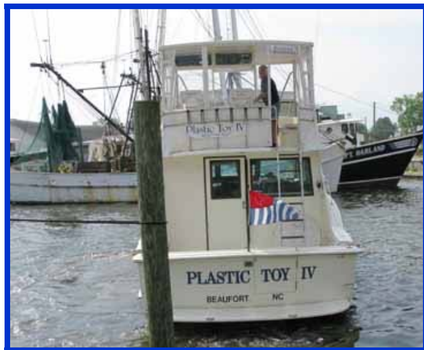
Plastic Toy IV