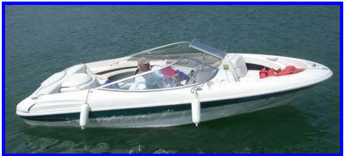
Dad's Toy IV