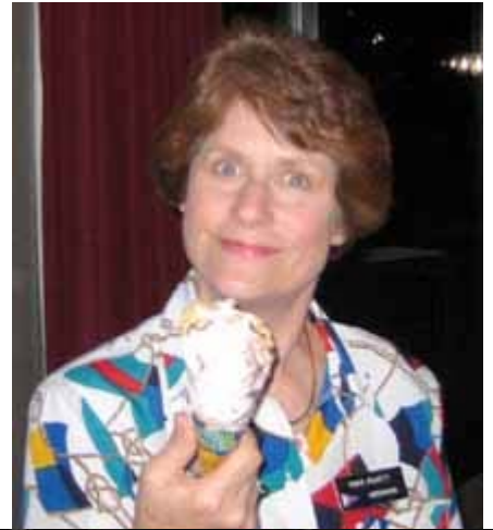
We had a Ball at the D-27 Change of Watch Beach Party On Friday Night.