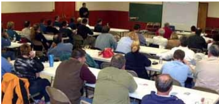
Spring 2006 Class

So get up and get out. Stop by Al Pike's Piloting class on Tuesday's or get by the Boating Course before it's over. You'll have a good time and get a chance to meet some future members.!