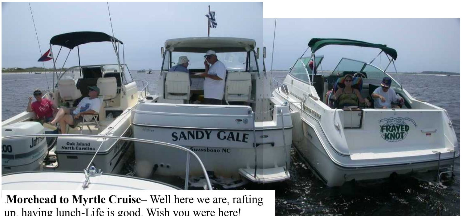
Morehead to Myrtle Cruise – Well here we are, rafting up, having lunch-Life is good. Wish you were here!